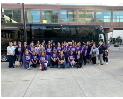
Region 8 Outing