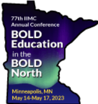
2023 IIMC Conference