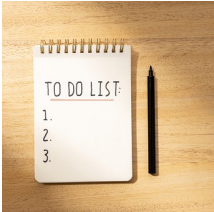
Birthdays (page 2) Municipal Legal Calendar (page 5)