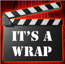
NMCA Institute & Academy or Clerk School Wrap Up